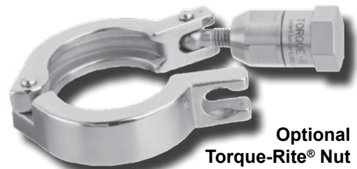
Optional Torque-Rite® Nut