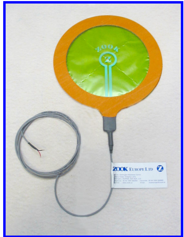
Typical installation components