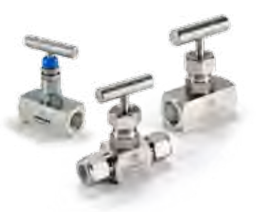
HIGH PRESSURE NEEDLE VALVES