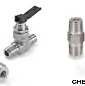
& ADJUSTABLE TOGGLE VALVES H-1200 SERIES