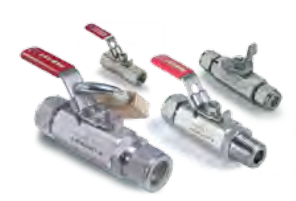
BALL VALVES WITH LOCKING DEVICE H-700 SERIES