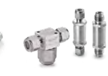
REMOVABLE & IN-LINE FILTERS H-600 SERIES